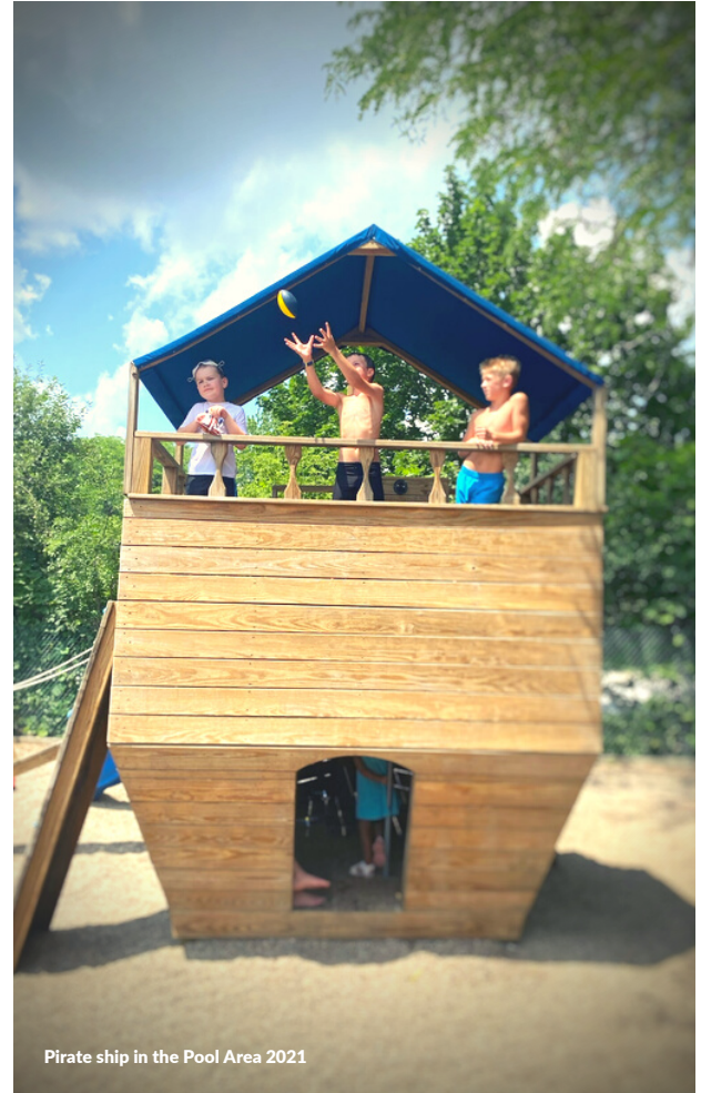
Pirate ship in the Pool Area 2021